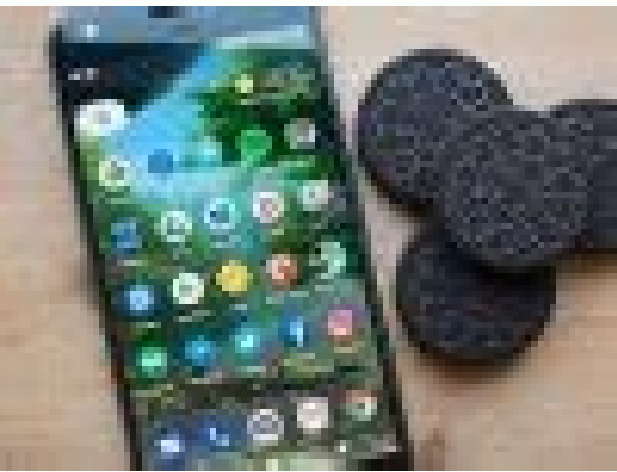
Huawei p9 update.